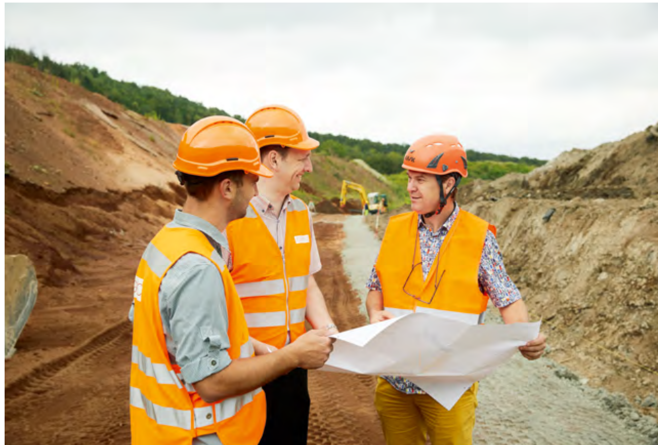
Elbisgraben Landfill, Liestal (Switzerland)