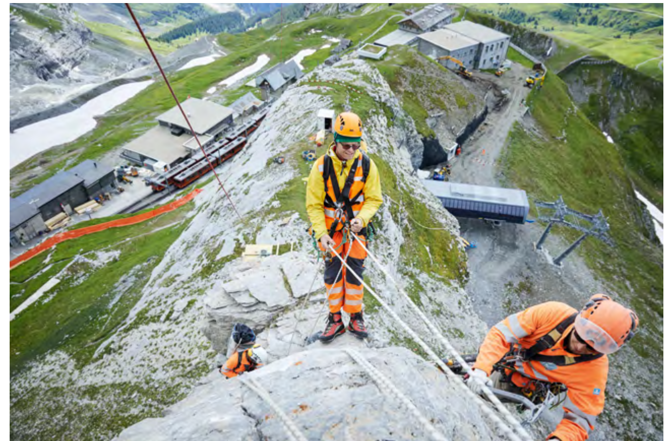
Cableway project «V-Bahn» for Jungfraubahn AG and Grindelwald-Männlichen AG, Grindelwald (Switzerland)

We establish trust. We use our decades of experience and broad-based expertise to identify potential hurdles at an early stage and to tackle and complete projects safely and efficiently.